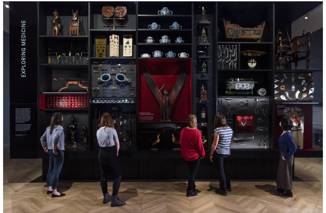
Visitors enjoy the Medicine Galleries at the Science Museum