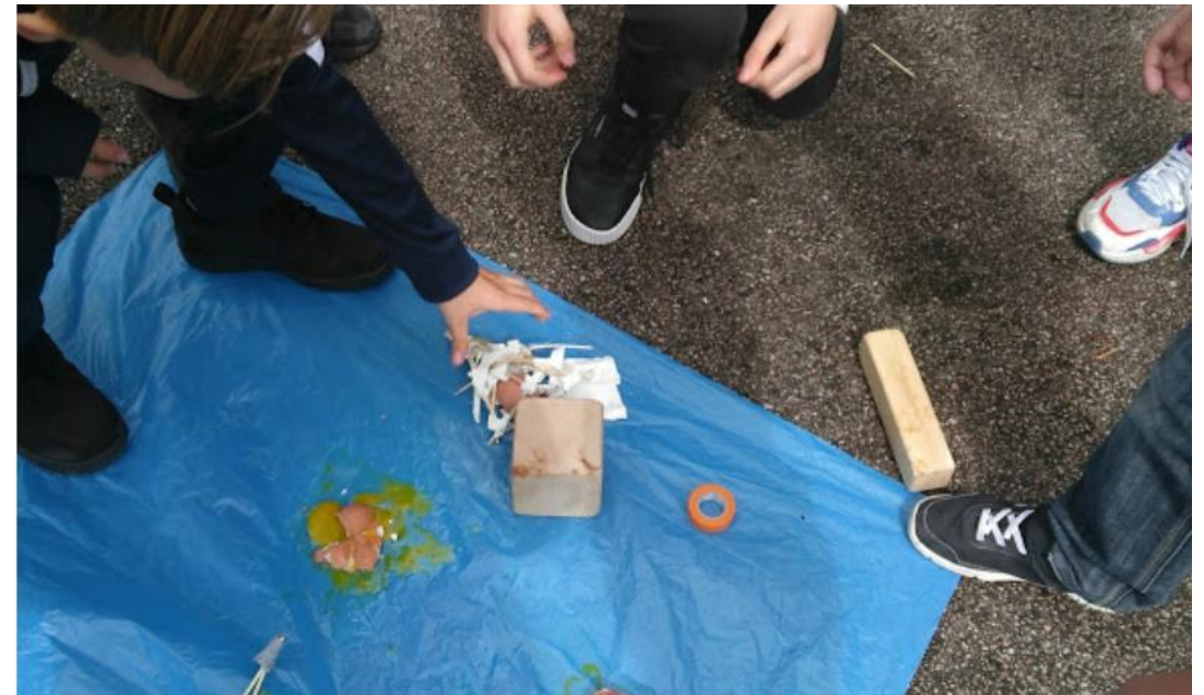
Make it Open: A hard egg to crack activity