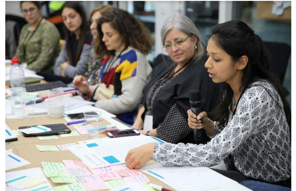
SySTEM 2020 co-design workshop on the future of informal learning, March 2019 (Helsinki, Finland).

https://www.ecsite.eu/activities-and-services/projects