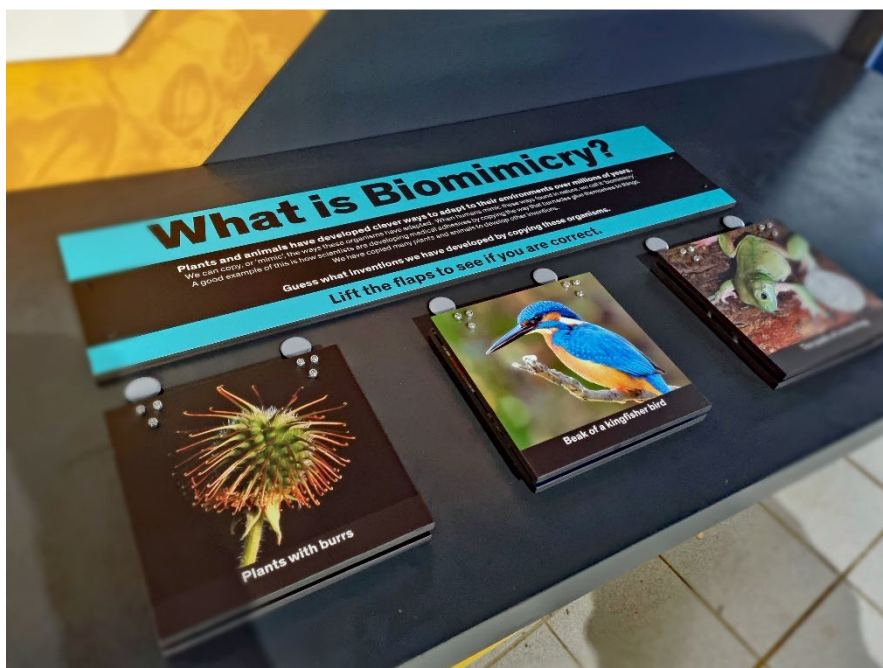
Biomimicry exhibit