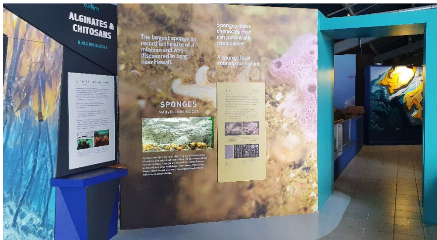
Alginates & Chitosans exhibit