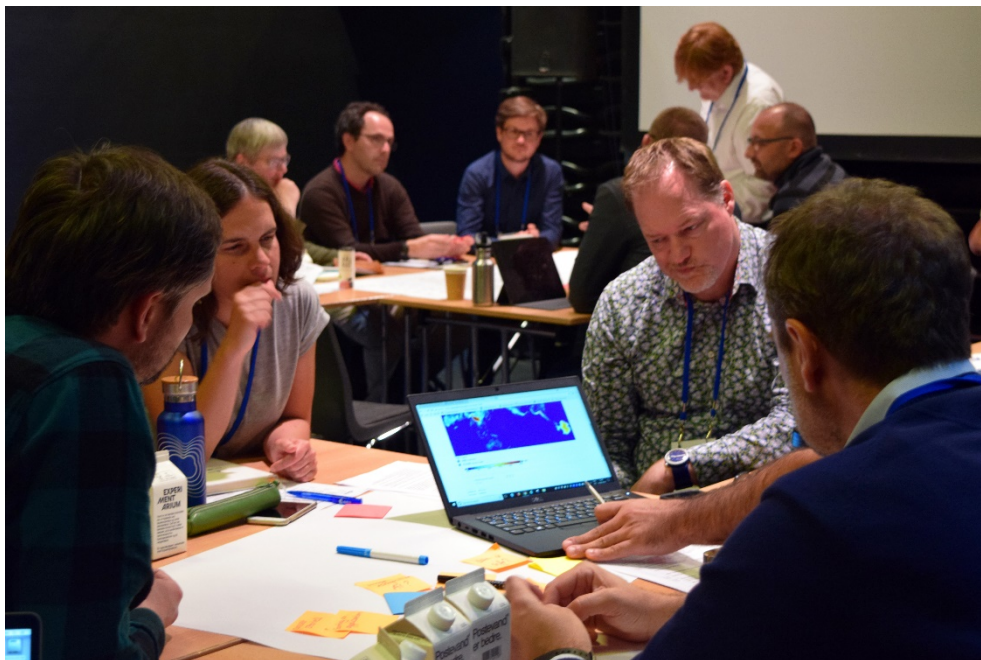
World Café discussion tables