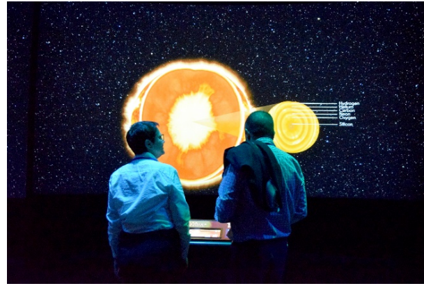
Participants explore the 'Made in Space' exhibition area