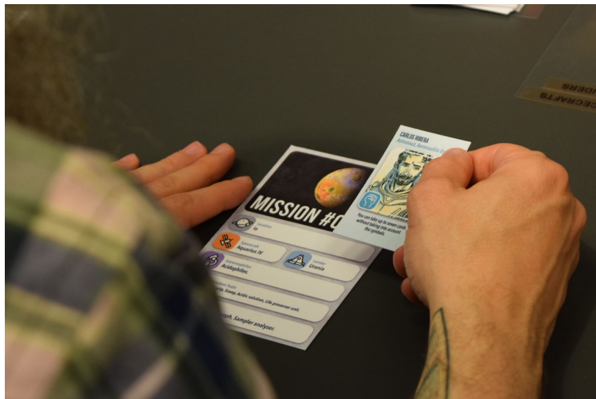
An advanced prototype of 'Alive! An Extra-terrestrial Game' is tried out at Ecsite Annual Conference 2019 Business Bistro.