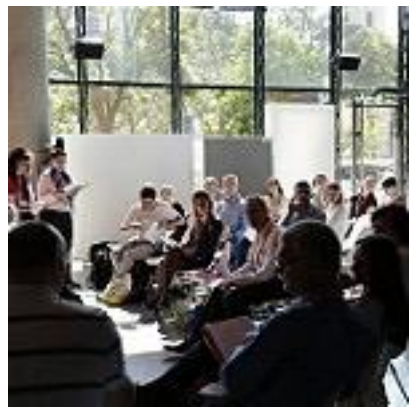
Plenary at Kunsthaus in Graz