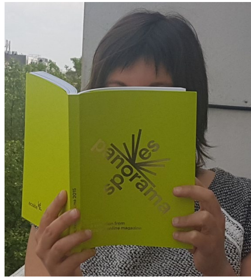
Spokes Panorama - 2015 edition

Spokes comes out around the 15 th of each month. Note: there are actually 11 Spokes numbers per year, with July-August combined in a summer issue out beginning of August.