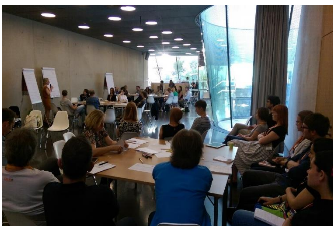
Ecsite Nature Group pre-conference in Graz 2016

During the morning sessions at the pre-conference, you can hear interesting speakers talking about their vision of how to make room for nature to develop alongside the metropolitic pulse. The sessions will also address how ethics and philosophy can help us when communicating this topic to policy makers and the general public. In the afternoon, two workshops will deal with the role, NHM/ SC can play in urban planning and how to address the ethical dilemmas that may arise. We will create small and big ideas together to take home to influence politicians, civil servants and citizens.