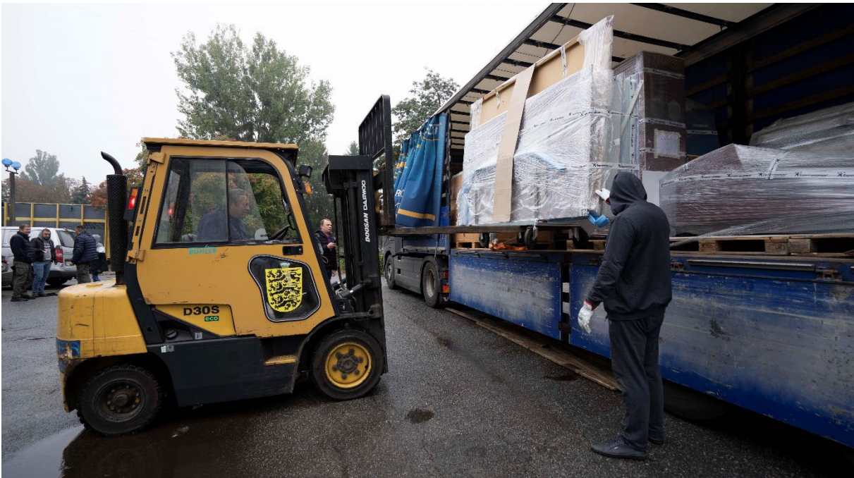
Pictured above : the Winter Sports exhibition in transit

We had immediate support to donate the exhibition but it was a real challenge transporting it to Ukraine. We are a non-profit organisation and were not able to cover the costs of the shipping. We looked into many different alternatives and just as we were about to give up, Mærsk stepped in and offered to not only cover the costs of the transportation but also handle the logistics and transportation itself.