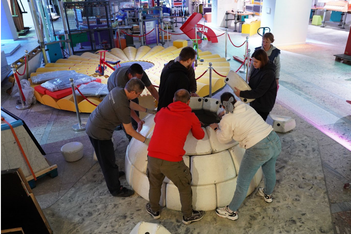
Pictured above : the team at the Junior Academy of Sciences putting the Winter Sports exhibition together

I would just say that the best way of being sustainable is recycling. Giving our Winter Sports exhibition a new life in Ukraine is also an excellent way to recycle a popular exhibition.