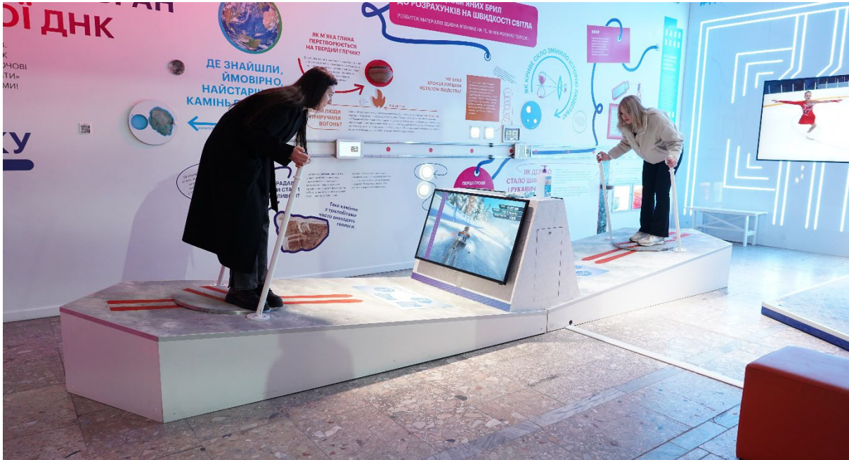
Pictured above : the Winter Sports exhibition installed in the Kyiv Science Museum, donated by Experimentarium

We donated the Winter Sports exhibition, where visitors explore many different winter sports and learn the science and technology behind them.