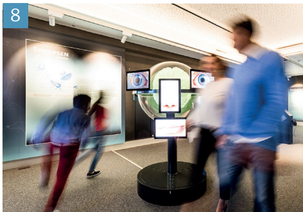
8: brain model

Detailed description for museum guides and digital material including video and audio for advertising and for training and lectures are also available / part of this offer. All exhibits are barrier-free. You can visit the special exhibition at the moment in the Welios Science Center in Wels / Austria up to the end of August 2020.