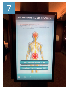
1, 2: brain model 3: synaptic game 4: homunculus 5: logic and psychopendulum 6: illusions 7: information about the nervous system (55' monitor)