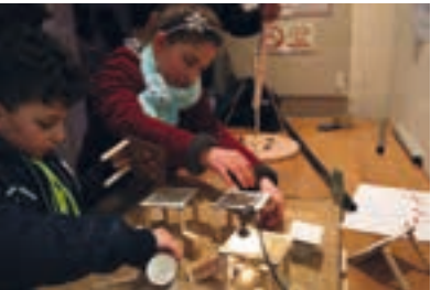
A.M. Qattan Foundation (Ramallah, Palestinian Territories)