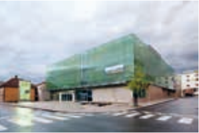
Jaermuseet (Narbo, Norway)