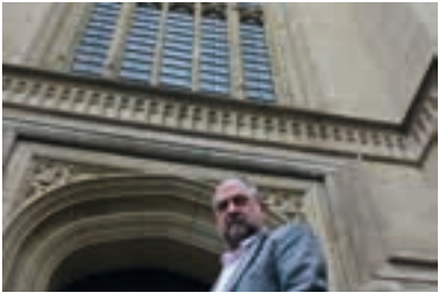
University of Bristol, Graduate School of Education (Bristol, United Kingdom)