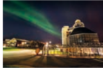
Nordnorsk Vitensenter (The Science Centre of Northern Norway) University of Tromsø (Tromsø, Norway)