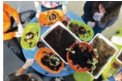
Centro Ciência Viva do Algarve (Faro, Portugal)