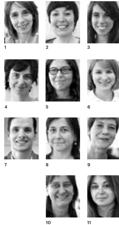
The Ecsite team in March 2016