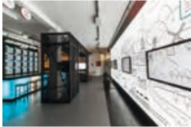
MACa-Museo A come Ambiente (Turin, Italy)