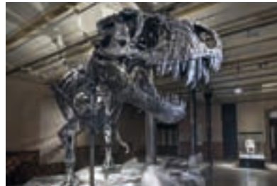
Museum für Naturkunde Berlin (Berlin, Germany)