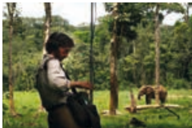
Fragments of Extinction (Pesaro, Italy)