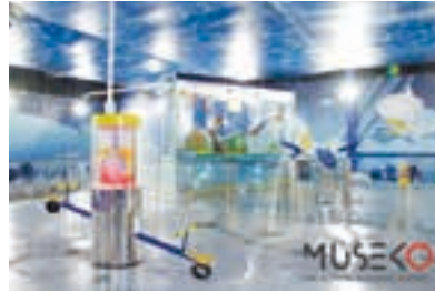
MUSEKO (Tallinn, Estonia)