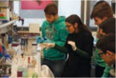
ICN2 – Institut Catala de Nanociencia i Nanotecnologia (Bellaterra, Spain)