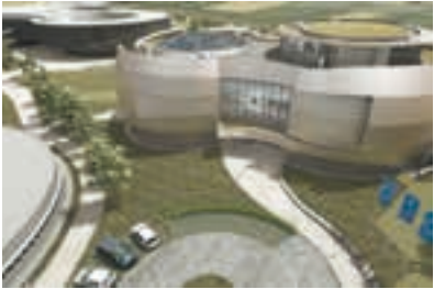
ESO – European Southern Observatory (Garching bei München, Germany)