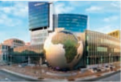
North Carolina Museum of Natural Sciences (Raleigh, United States)

Credits for pictures on p. 43 & 45