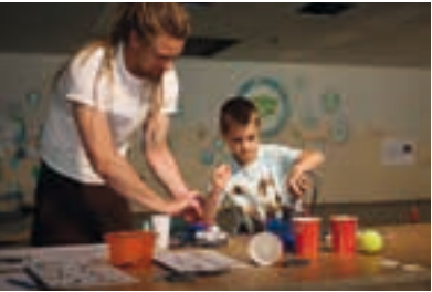
Science Center-Netzwerk (Vienna, Austria)