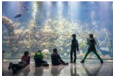
RZSA - Royal Zoological Society of Antwerp (Antwerp, Belgium)