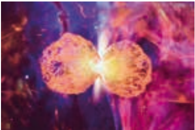
Infini.to - Planetarium of Turin, Museum of Astronomy and Space Science- Assoziacione Apriticielo (Turin, Italy)