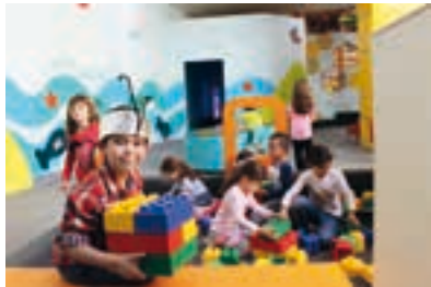
The Children's Museum Jordan (Amman, Jordan)