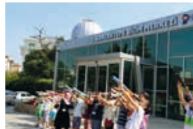
Sancaktepe Science Center Observatory and Planetarium (Istanbul, Turkey)