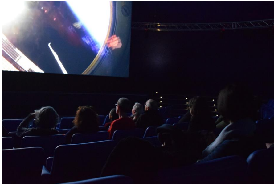
'Earth Our Planet Our Home' experience at Columbus earth center