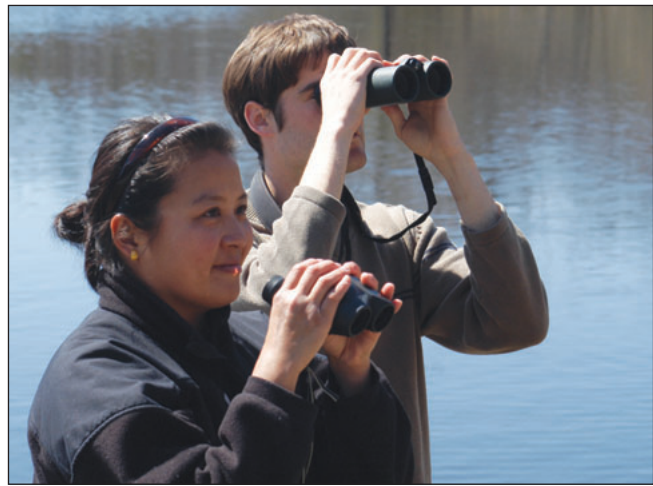
Figure 1. Citizen scientists at work in the field.

The term “Anthropocene” was put forth to capture the idea that direct human impacts are having so large an effect on ecosystems around the globe that we have effectively entered a new geological era (Crutzen 2002). Researchers have begun to emphasize the importance of understanding the ecology of working landscapes and the enactment of conservation measures within anthropogenic biomes or “anthromes” (Ellis and Ramankutty 2008). Citizen science is ideal for working with farmers and residents to study the ecology of urban, agricultural, and residential landscapes (Figure 2; Cooper et al. 2007; Ryder et al.