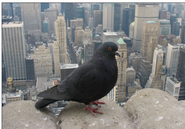
Figure 2. For the first time, human impacts have pushed the Earth into what is effectively a new geological era, the Anthropocene, which also means that Earth stewardship is more important than ever.

when combined with conservation goals. For example, a research initiative (Grupo Tortuguero) co-created with local fishermen in Mexico identified bycatch of small-scale local fisheries as an important conservation threat to loggerhead sea turtles ( Caretta caretta ), through a partnership with the very communities whose practices could make a difference (WebTable 1; Peckham et al. 2007).