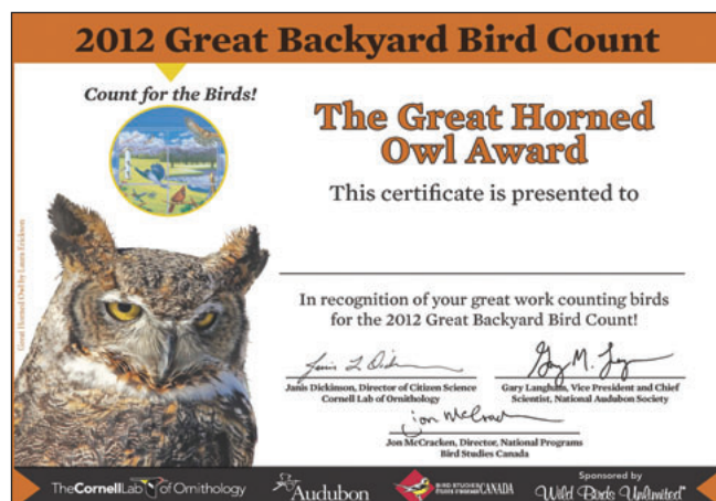
Figure 4. Citizen-science project developers have begun to use various strategies – including contests, incentives, and badging systems – to motivate volunteers, to create a sense of community for participants, and to recognize their efforts.

al. 2009b). This model – applicable to both participant-driven (collaborative or co-created) and scientist- or institution-led (contributory) projects – often begins with a well-defined team of participant stakeholders, ecologists, education specialists, computer scientists, communications/marketing specialists, and evaluators, who work together to determine clear, project-specific education and research goals. The team then identifies explicit measurable outcomes and the necessary tools and features required to achieve those outcomes through a process of intentional design. Iterative periods of design, evaluation, and revision ensure successful protocols, training materials, recruitment, data entry, and data-sharing infrastructures, while continuing to align scientific and educational objectives with project activities and the abilities/expectations of participants. Gradually, this process adapts the project to its audience, thereby improving learning and research outcomes.