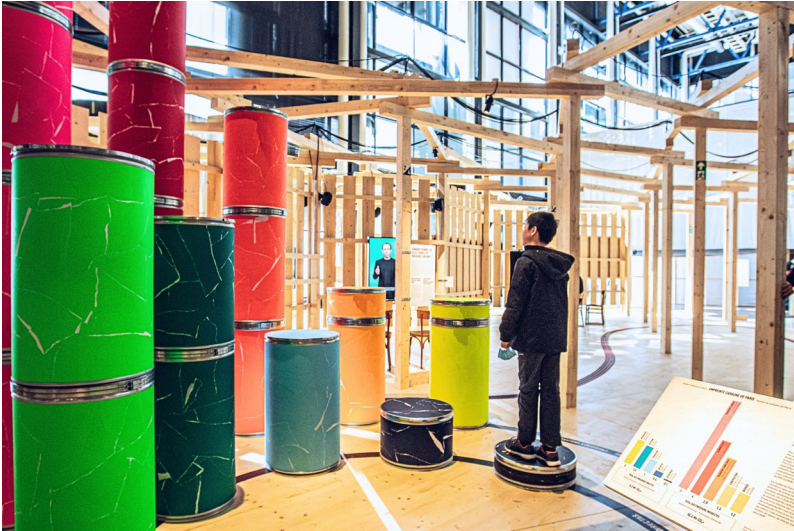
Paris carbon footprint