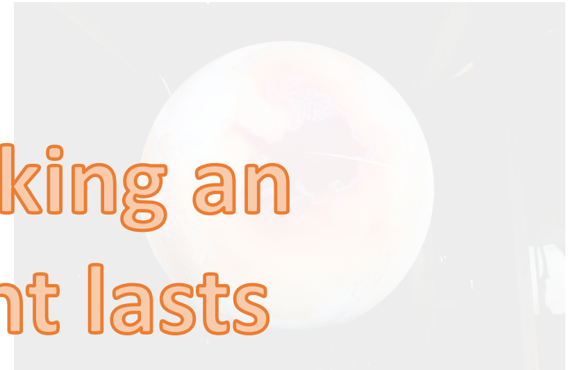
IPCC scenarios showed on a sphere