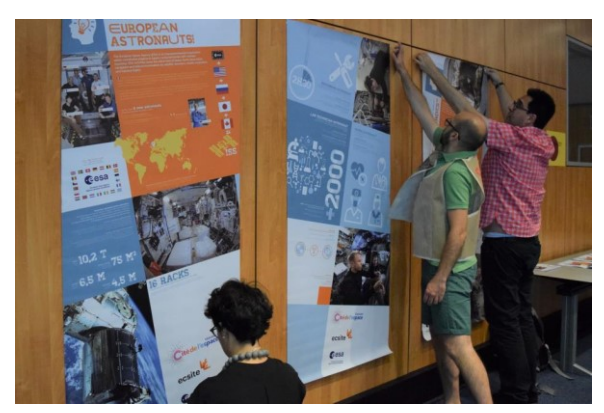
Workshop participants could consult the ISS exhibition catalogue and see three printed exhibition panels