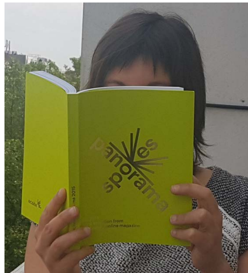
Spokes Panorama - 2015 edition

Spokes comes out around the 15 th of each month. Note: there are actually 11 Spokes numbers per year, with July-August combined in a summer issue out beginning of August.