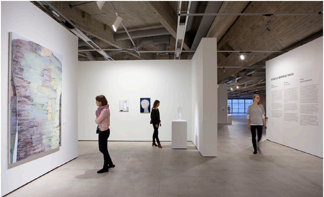
A tourist at the exhibition Touch in the Espoo Museum of Modern Art (EMMA).

As museum budgets decrease, and as we use this dwindling cultural funding for social, business and educational purposes, these new tasks and duties come at the expense of our original core competence of cultural heritage. In other words, we achieve fewer results in preserving, studying and exhibiting cultural heritage.