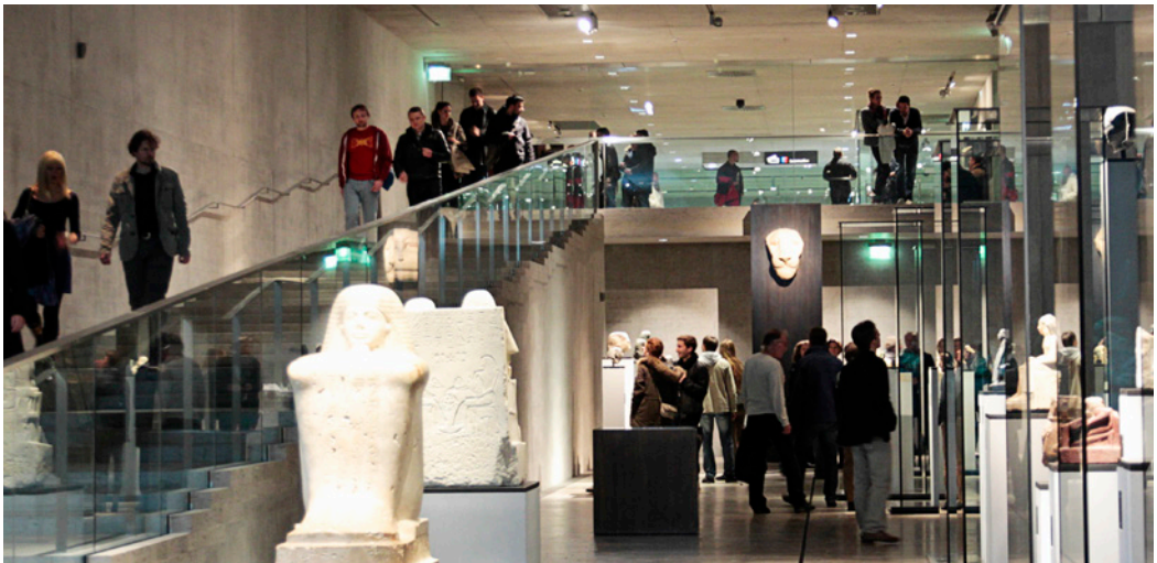
Visitors in the Staatliches Museum Ägyptischer Kunst in Munich