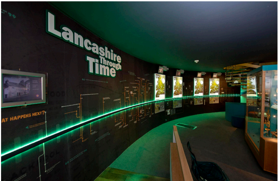
The Museum of Lancashire was one of five museums in Lancashire that was closed in 2016

Museums Change Lives is the MA’s vision for the positive social impact that museums