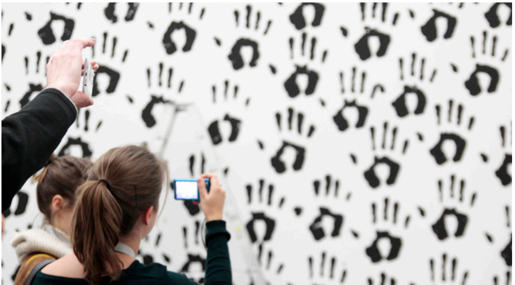
Visitors in the Pinakothek der Moderne in Munich

From the very beginning it is important, when museums negotiate their mission, to understand how it relates to these elements, and to make it intelligible to the public. This helps a museum to strategically take over the issue of value creation, and not passively and defensively react to demands from outside, which is what can happen if it does not have the right perspective in mind.