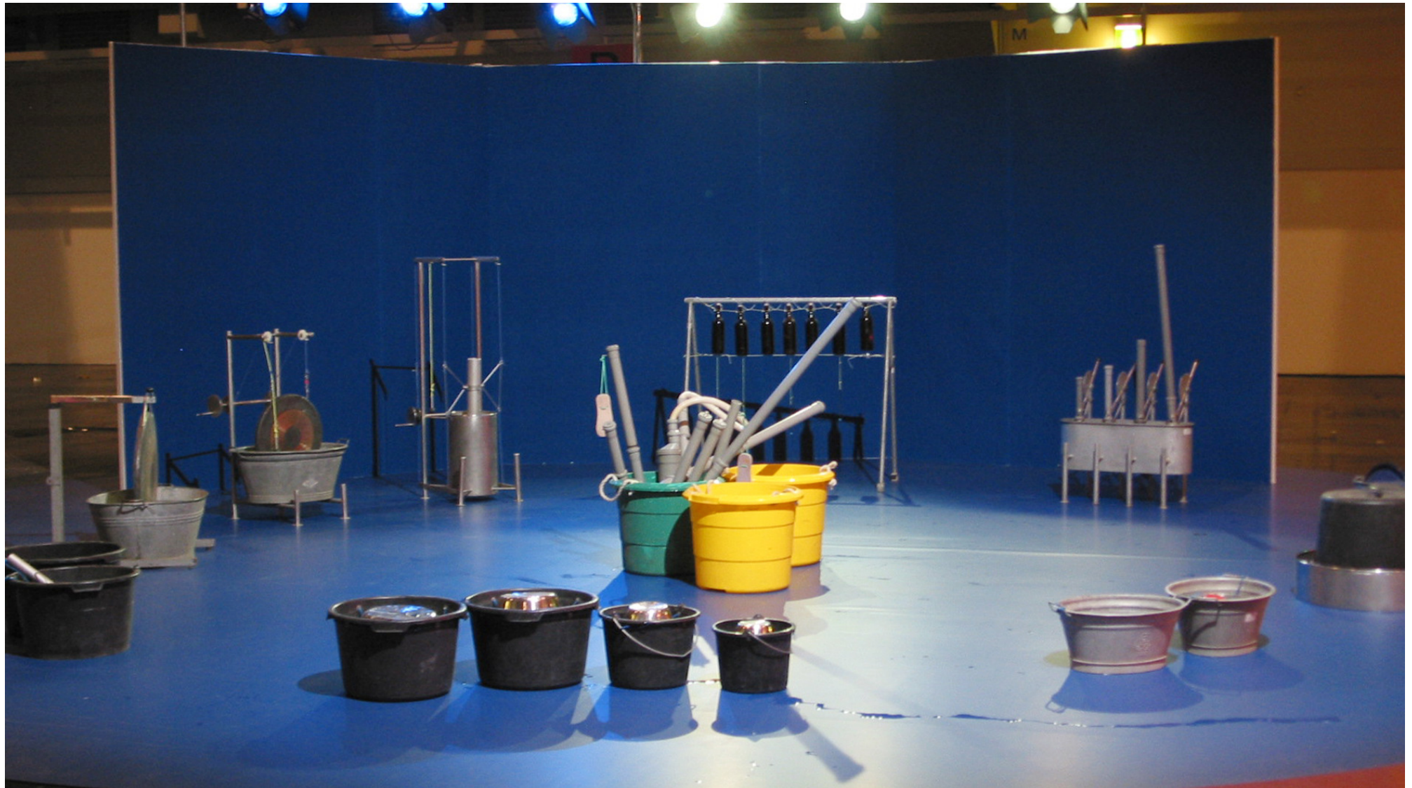
Setup m4k Frankfurt, 2003