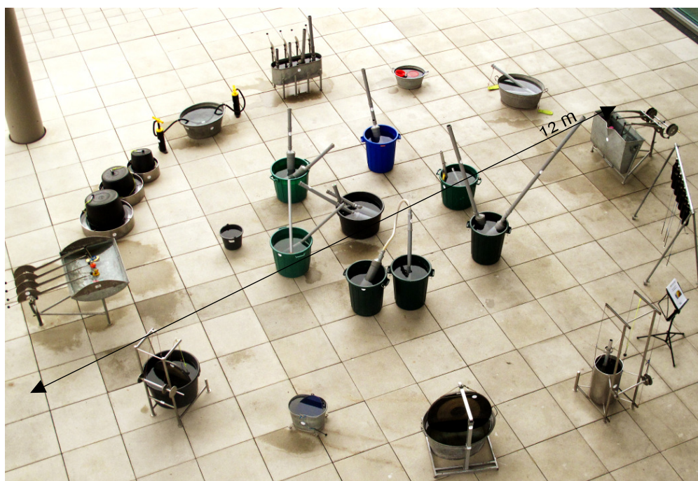
Water Orchestra 12 Meters diameter Setup in Wolfsburg, 2009